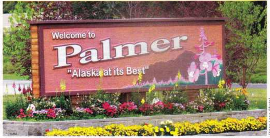
The town of Palmer hosted the 35th Annual Alaska Hunter/Jumper Association show at the state fairgrounds.